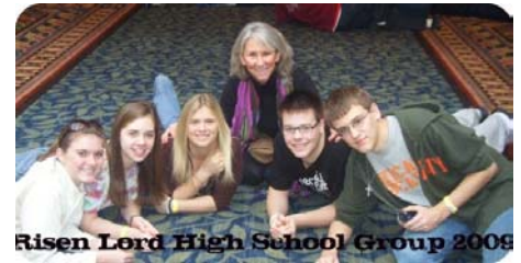
Risen Lord High School Group 2009