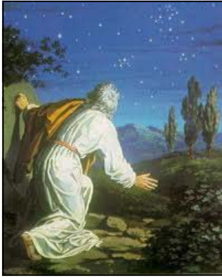
Abraham and the stars of the sky.