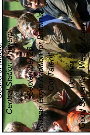
the David Letterman Show

The outdoor water hose will be rigged as a high water shower for kids to take off before going for changing. Towels will also be good to bring. "Sound of Music: Central Station Answer" September 26