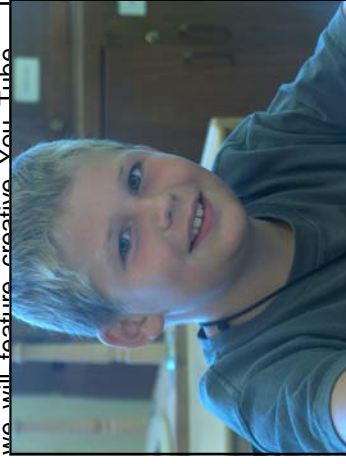
"Sound of Music"